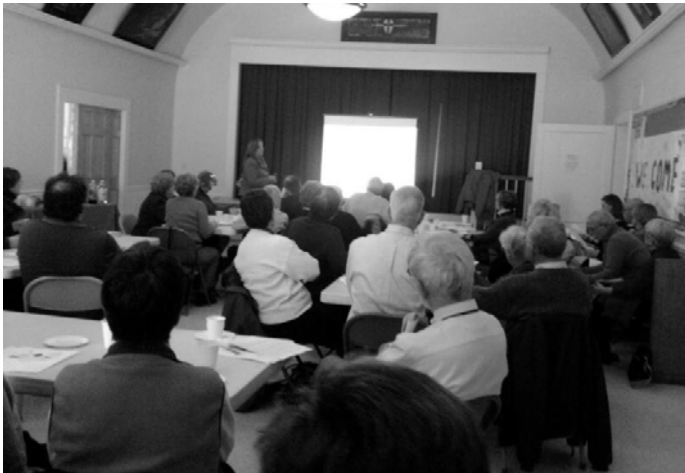
Annual Meeting, January 23, 2011